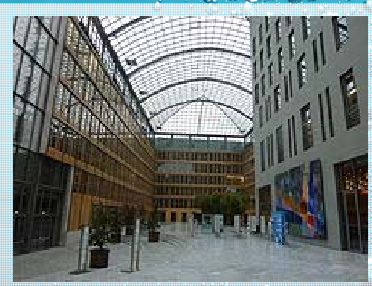
Atrium - Entrance hall of the BDI-Building