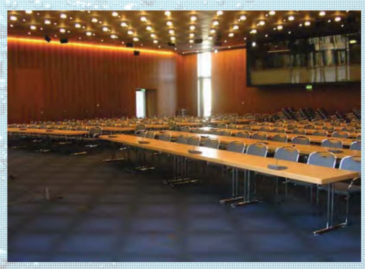
Conference room, Franz-von-Mendelssohn-Hall